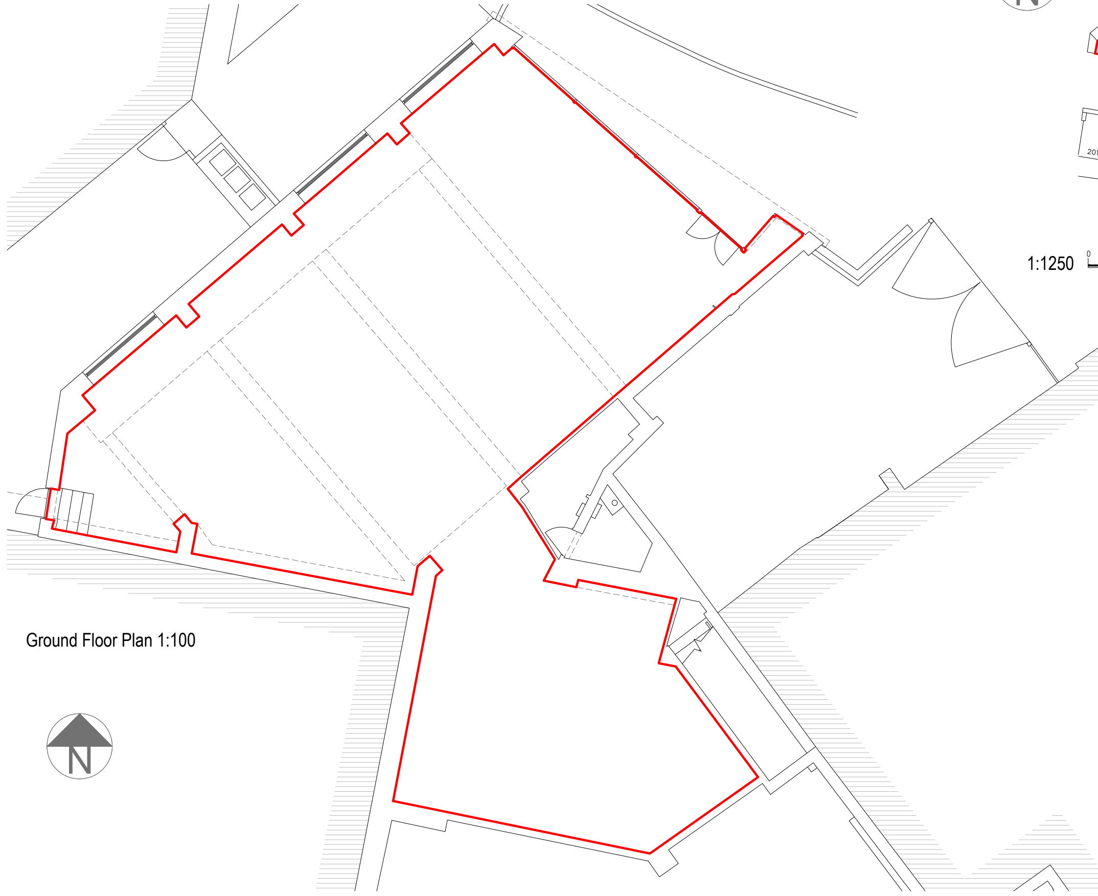
Ground Floor Plan 1:100