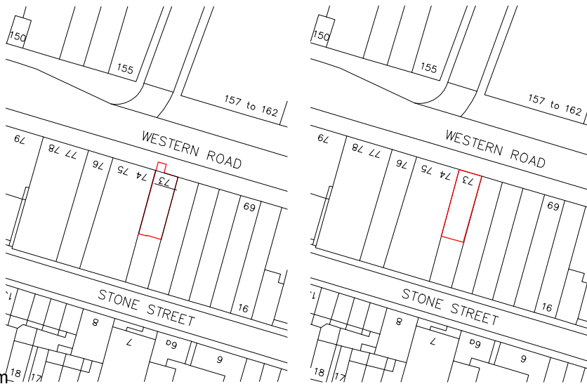
Location plan 1:1250 1:1250 0 10 20 30 40 50 60 70 80 90 100