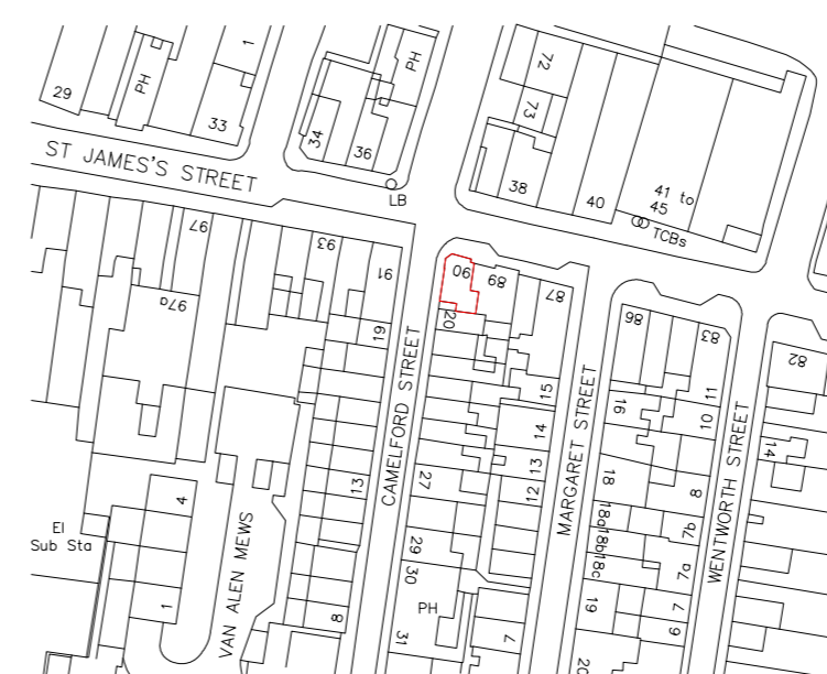
Location plan (Ground Level) 1:1250