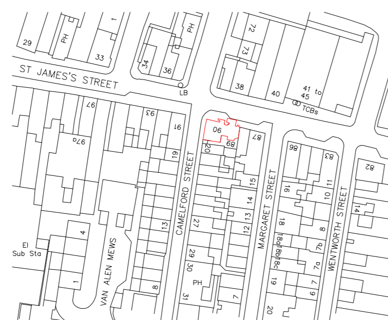
Location plan (Basement Level) 1:1250